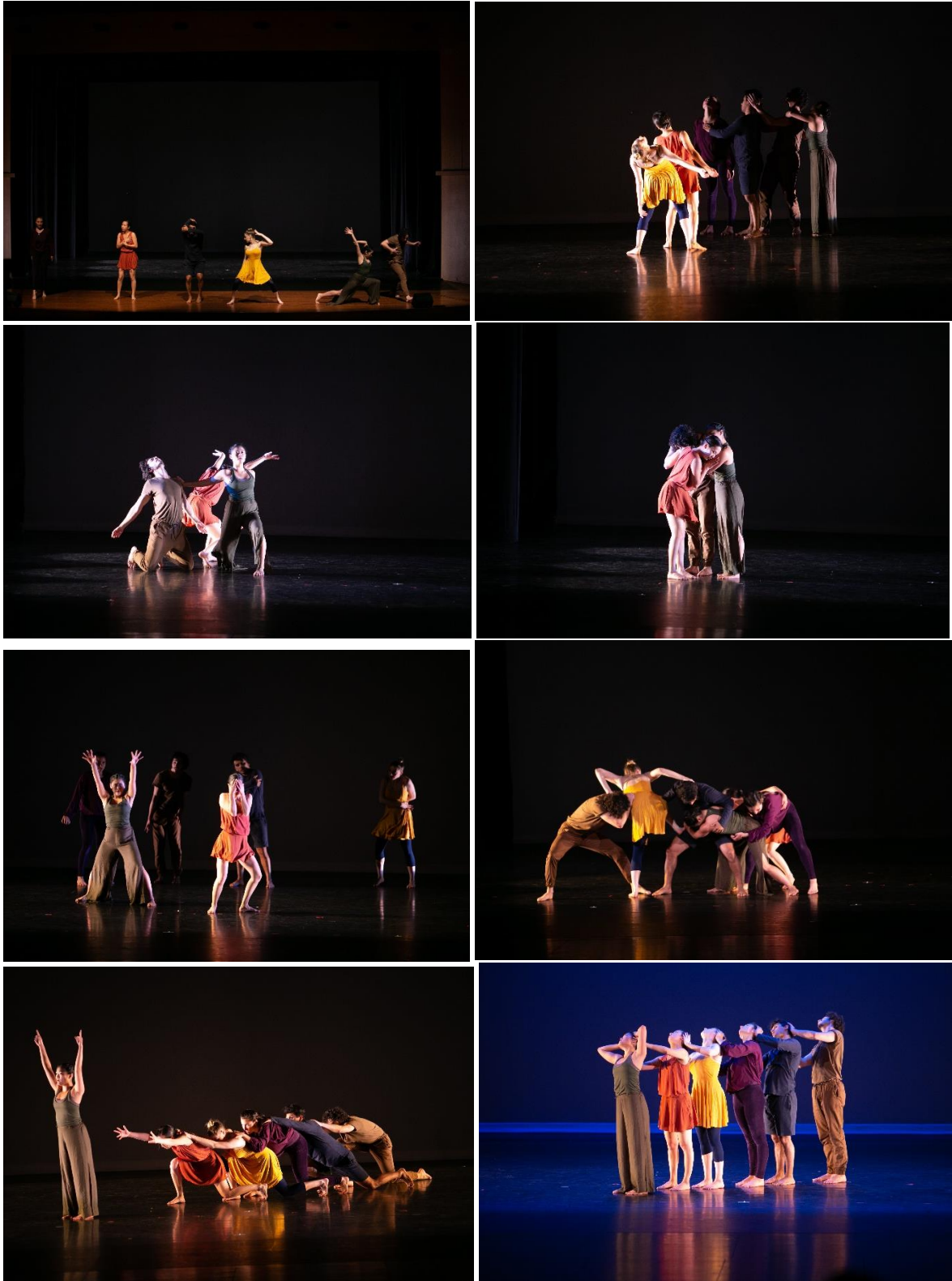
Figure 4. Important choreographic moments (photos are labeled a-h from left to right and top to bottom).