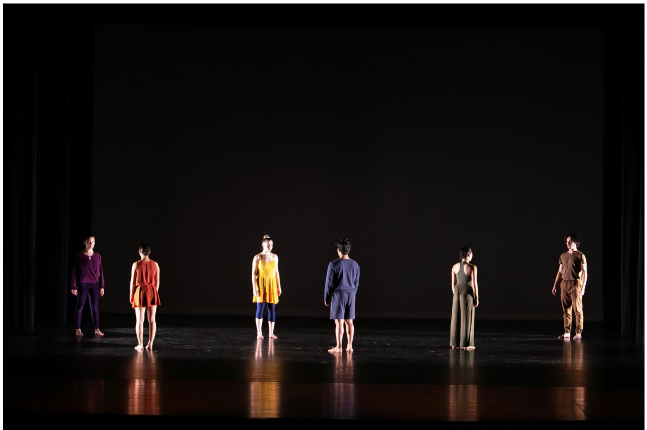
Figure 3. Costuming.